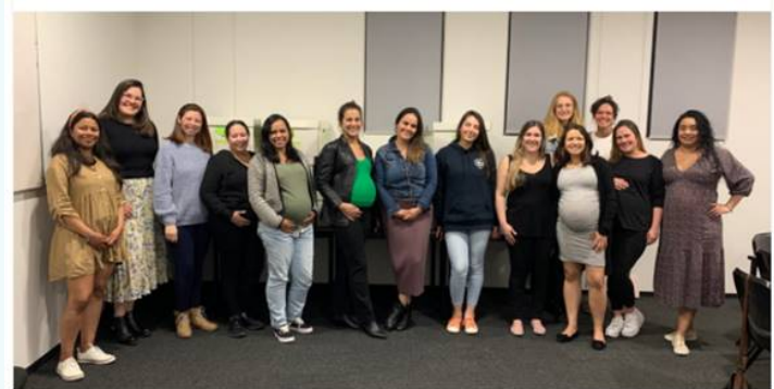
This first time event on 15/10/2021 and was a great success, it was very nice to be there with all those beautiful pregnant women.

Demand for baby boxes continues to grow exponentially - and Baby Box are on track to give out over 40 boxes in the coming month alone.